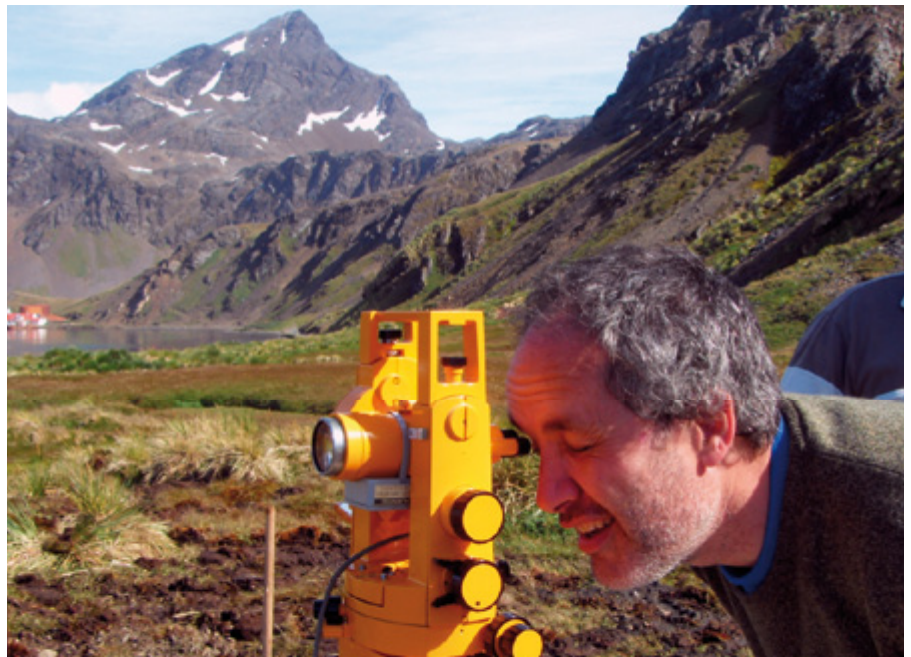
Manual survey during installation of the new BGS magnetic observatory on South Georgia. This observatory will be used to monitor the weakening magnetic field in the 'South Atlantic anomaly', where space weather impacts deeper into the atmosphere.

Scientific insights since 2003 are already producing improved hazard models, including a new BGS–Lancaster University model of GIC flow in the UK grid. This is cutting-edge science where we have combined a three-dimensional model of the Earth's electrical conductivity underlying the UK with a two-dimensional, time-varying model of electrical sources in the ionosphere. We